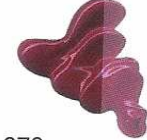
373 Rojo Cadmio Púrpura Cadmium Red Purple ★★★ PR108