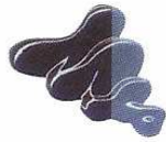
351 Sombra Azulada Bluish Shadow ★★★■ PB15:3, PBk11