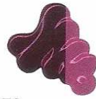
378 Laca de Garanza Clara Light Madder Lake ★★★ PR83, PR122