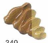
349 Amarillo Ocre Oro Gold Ochre Yellow ★★★ PY42, PR101, PBk11