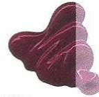
345 Laca de Garanza Madder Lake ★★ PR83