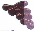
346 Laca Carminada de Alizarina Alizarin Crimson ★★★ PY110, PR177, PG7