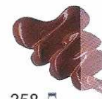
358 Tierra de Sombra Quemada Raw Burnt Umber ★★★ PR101, PBi6