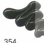
354 Tierra Verde Terre Verte ★★★ PW6, PY83, PG7, PBK7