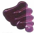
377 Laca Magenta Magenta Lake ★★★ PR122, PB15:3