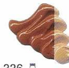
336 Tierra de Siena Natural Raw Sienna ★★★ PW6, PY42, PR101, PBi6