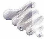
311 Gris Neutro Neutral Gris ★★★■ PW6, PB29, PBk11