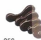
356 Sombra Quemada Burnt Umber ★★★ PW6, PR101, PBk7