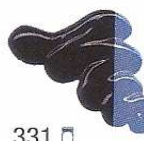
331 Azul da Prusia Prussian Blue ★★★ PB27