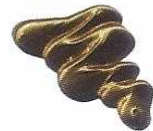
388 Bronce Iridiscente Iridescent Bronze ★★★☐ PW6, 20, PY42, PBK7