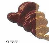
375 Stil de Grain Pardo Brown Stil de Grain ★★★ PY83, PR83, PG7