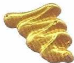
385 Oro Iridiscente Iridescent Gold ★★★☐ PW6, PW20, PY42