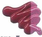
379 Carmin Carmine ★★ PR57:1