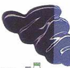
348 Ultramar Claro Light Ultramarine ★★★ PB29