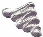
386 Plata Iridiscente Iridescent Silver ★★★☐ PW6, PW20, PBK7