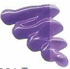
321 Violeta Cobalto Cobalt Violet ★★★ PW6, PB15, PV23