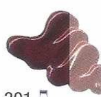
301 Rojo Oxido Transparente Transparent Oxide Red ★★★ PR101