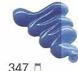
347 Azul Cerúleo Cerulean Blue ★★★ PW6, PB15, 27, PBK7