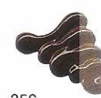
356 Sombra Quemada Burnt Umber ★★★ PW6, PR101, PBk7