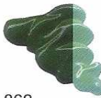
362 Verde Inglés Oscuro Dark English Green ★★★ PW6, PY2, PB15:3, PG7