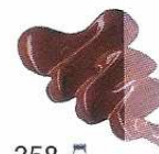
358 Tierra de Sombra Quemada Raw Burnt Umber ★★★ PR101, PBi6