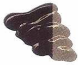
376 Marrón de Garanza Brown Madder ★★★☐ PY83, PR83, PG7