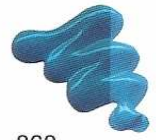
363 Azul Turquesa Turquoise Blue ★★★ PB15:3, PG7