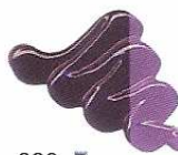
330 Violeta Permanente Oscuro Permanent Deep Violet ★★★ PV23