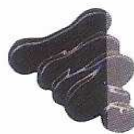
399 Gris de Payne Payne's Grey ★★★■ PB29, PBk11