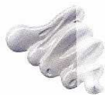
311 Gris Neutro Neutral Gris ★★★■ PW6, PB29, PBk11