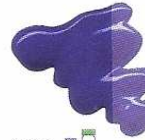
308 Azul Cobalto Cobalt Blue ★★★ PW6, PB29