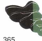
365 Verde Hooker Hooker's Green ★★★ PB15:3, PY83