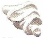
389 Blanco Iridiscente Iridescent White ★★★☐ PW6, PW20