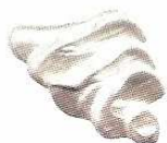
389 Blanco Iridiscente Iridescent White ★★★☐ PW6, PW20