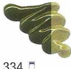
334 Verde Oliva Olive Green ★★★ PY83, PB15:3, PBK7