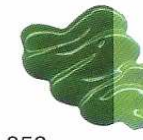
352 Verde Permanente Claro Light Permanent Green ★★★ PY3, PY83, PG7