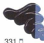
331 Azul da Prusia Prussian Blue ★★★ PB27