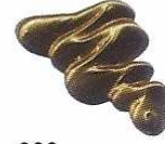
388 Bronce Iridiscente Iridescent Bronze ★★★☐ PW6, 20, PY42, PBK7