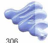
306 Azul Hortensia Hortensia Blue ★★★ PW6, PB29