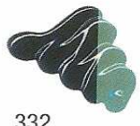
332 Verde Permanente Oscuro Permanent Green Deep ★★★ PG7