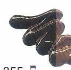
355 Sombra Natural Raw Umber ★★★ PY42, PBi6, PBk11