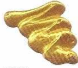
385 Oro Iridiscente Iridescent Gold ★★★☐ PW6, PW20, PY42