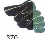
370 Verde Cuprico Claro Light Cupric Green ★★★ PG36