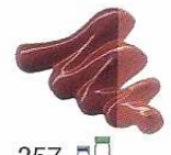
357 Tierra de Siena Quemada Burnt Sienna ★★★ PY42, PR101