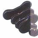
399 Gris de Payne Payne's Grey ★★★■ PB29, PBk11