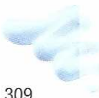
309 Azul Celeste Sky Blue ★★★ PW6, PB15, PB27