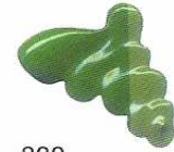
333 Verde Paul Veronese Paul Veronese Green ★★★ PW6, PY13, PB15, PG7