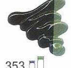
353 Verde Vessie Sap Green ★★★ PR83, PB15, PB27