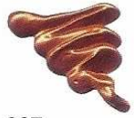
387 Cobre Iridiscente Iridescent Copper ★★★☐ PW20, PR101