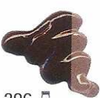
396 Sepia Sepia ★★★ PR101, PBk11