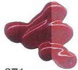
371 Laca de Garanza Rosa Antigua Antique Rose Madder ★★★ PY82, PR122