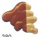
380 Amarillo Oxido Transparente Transparent Oxide Yellow ★★★ PY42