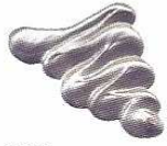
386 Plata Iridiscente Iridescent Silver ★★★☐ PW6, PW20, PBK7