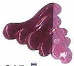
315 Magenta Magenta ★★★ PR122