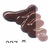
337 Marrón Van Dyck Van Dyck Brown ★★★ PY83, PR112, PBi6, PBk7