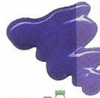
308 Azul Cobalto Cobalt Blue ★★★ PW6, PB29