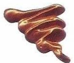
387 Cobre Iridiscente Iridescent Copper ★★★☐ PW20, PR101