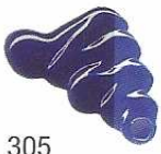
305 Azul Ftalocianina Phtalocyanine Blue ★★★ PB15:3