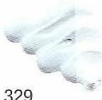
329 Azul Real Royal Blue ★★★ PW6, PB15:3