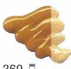
360 Amarillo Ocre Yellow Ochre ★★★ PY42